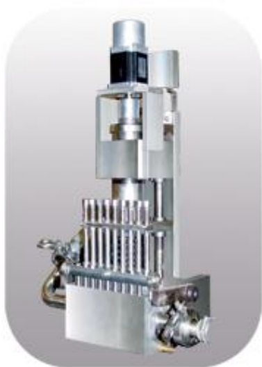
High precise automatic measuring adjustment equipment