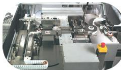
High quality continuous sealing