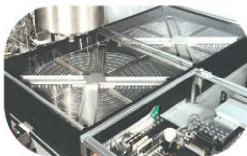
Continuous low temperature cooling shaping